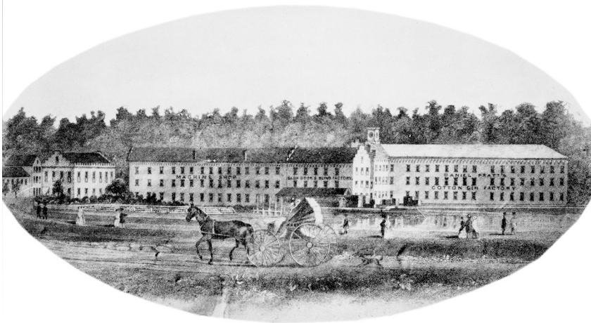
Far right: Daniel Pratt's Cotton Gin Factory, Prattville

build a manufacturing village so as to give employment to as many people as I can with a special eye to the moral and religious condition of the people."