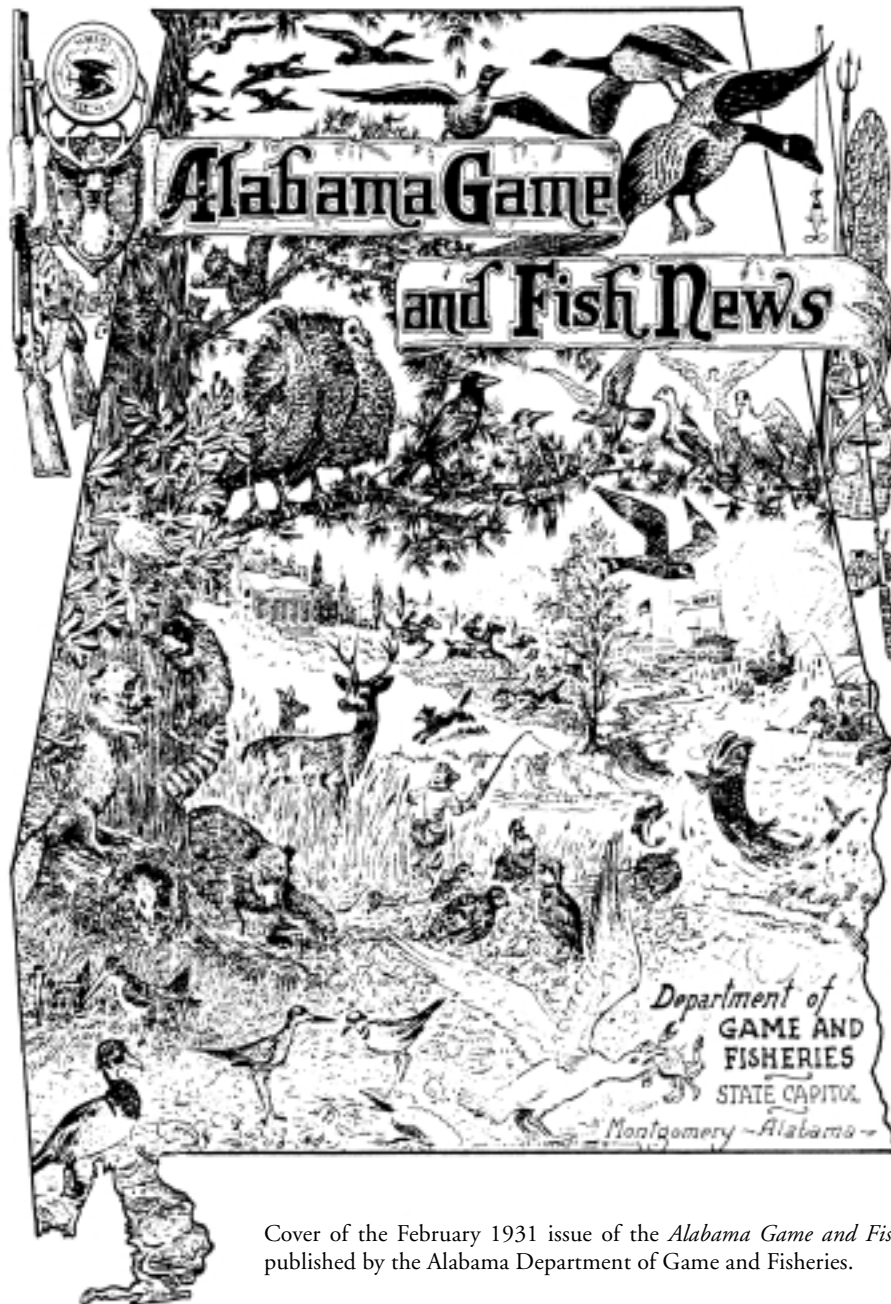
Cover of the February 1931 issue of the Alabama Game and Fish News , published by the Alabama Department of Game and Fisheries.

This interesting illustration shows some of the wonderful diversity of Alabama's wildlife. How many animals, birds, and fish can you identify in the picture? (We found 10 kinds of mammals, 13 birds, 2 fish, 1 reptile, and 2 invertebrates.)